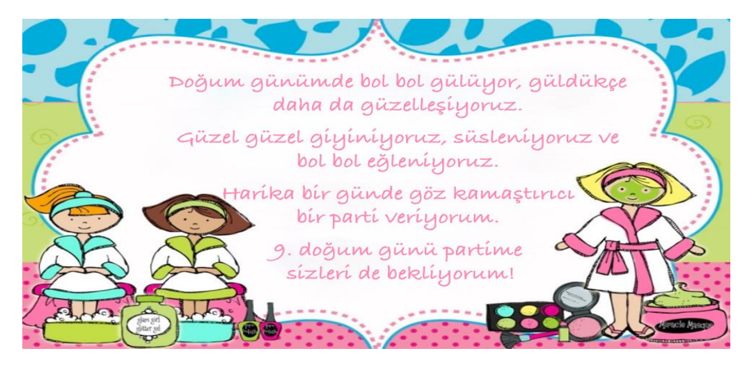
Figure 1. Birthday invitation card<sup>1</sup>

Borrowing and adapting from Lewison, Leland, and Harste (2014, p.195), the following questions guided students' investigation: