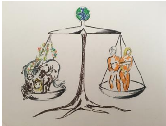
Figure 4. Natural Balance (Group 26, Denizli)

As a concept, it discusses natural balance. Animal rights are underlined through this concept. If we critically approach to image, we can articulate that people actually cause the extinction of animals and the deterioration of the natural balance by buying clothes made from animal fur and skin for their own pleasure.