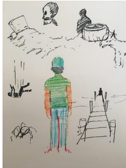
Figure 5. Repressed Emotions (Group 44, Kayseri)

Briefly stated, the teachers created artistic works by producing meanings in social, cultural, economic and psychological contexts. Such a practice in the workshop contributed to the teachers in terms of creating meaning from visual images, approaching them from different perspectives and looking critically.