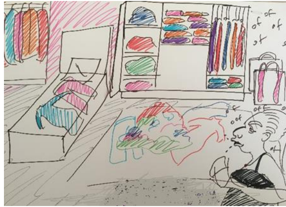
Figure 2. Nonsatisfaction (Group 11, Erzincan)

Some teachers commented the overall message underlying the image in the context of culture and society according to gender roles. In this respect, while they described men as strong, the one who can manage themselves, they described women as follows: weak, destined to be ruled, easily manipulated, whose purpose of coming into the world is to serve men and to reproduce. Some teachers' perceptions towards the images include the following statements: people of all colors and types can live together and accepting differences are natural. Thus, some groups questioned being sensitive to different cultures and created images using such concepts as respect for differences, empathy and tolerance in their artistic works. For example, Group 21 made an abstract transfer by using fingerprints of the group members in their artistic work 'Respect for Diversity.' They shared their views pertaining to the work; remarking that 'We made a picture that conveys the message of respecting for differences, not being prejudiced, welcoming people's different thoughts (good and bad) with tolerance, and accepting ourselves and others as what it is.'